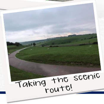
Taking the scenic route!