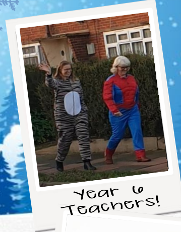
Year 6 Teachers!