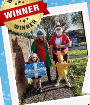
Best Fancy Dress!