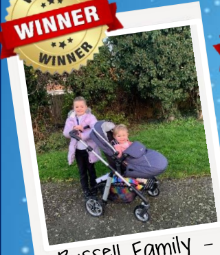
Russell Family - Most Miles (521.75)