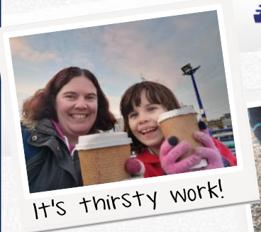
It's thirsty work!