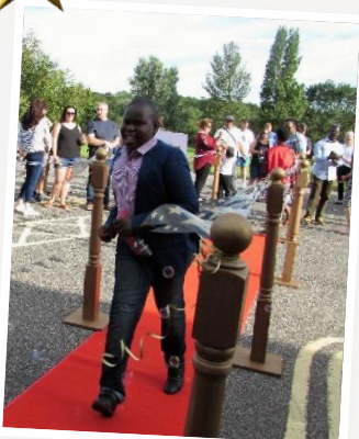
Red Carpet Arrival!