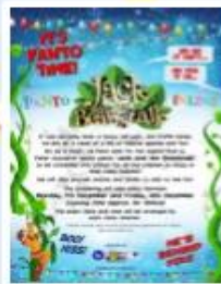
Christmas Online Panto! ✓