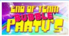
'Bubble' Discos! ✓

Two Friendship benches (arriving over the summer)