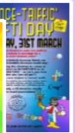
Mufti Days! ✓