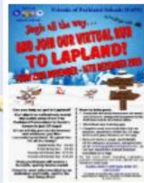
Virtual Fun Run to Lapland! ✓