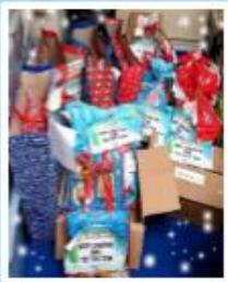
Christmas gift for every child! ✓