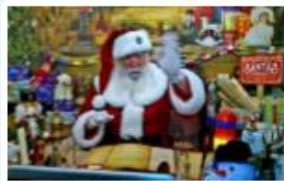
Video call from Santa! ✓