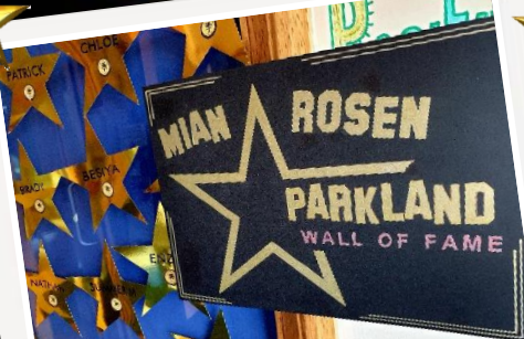
Parkland Wall of Fame!

What a wonderful time the Year 6's had at their Leavers Prom! Thank you to all the parents, carers and teachers that kindly volunteered their time and gave their support that allowed this event to happen. A BIG thank you to the AMAZING generosity of the parents who paid for pizza, supplied balloon decorations, baked cakes, provided ice cream toppings and all those that put in their time to make this event a success. We are certain the Year 6's had an amazing time and made some lasting memories.