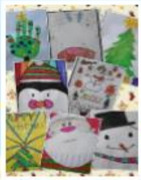
Christmas Cards! ✓