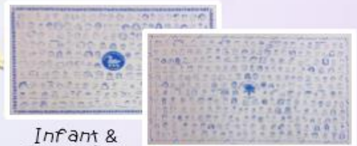
Infant & Junior Tea Towels! ✓