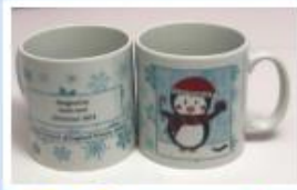
Christmas Mugs! ✓