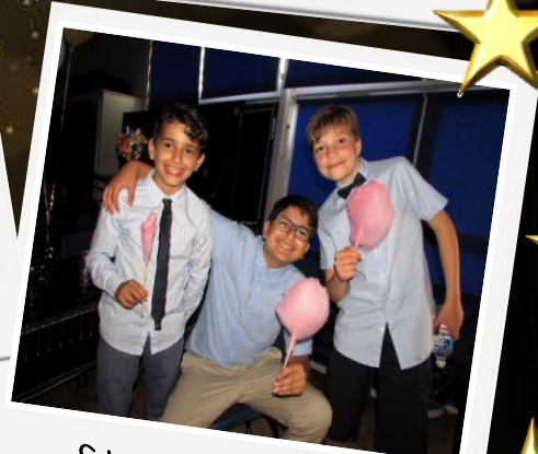
Strike a Pose!